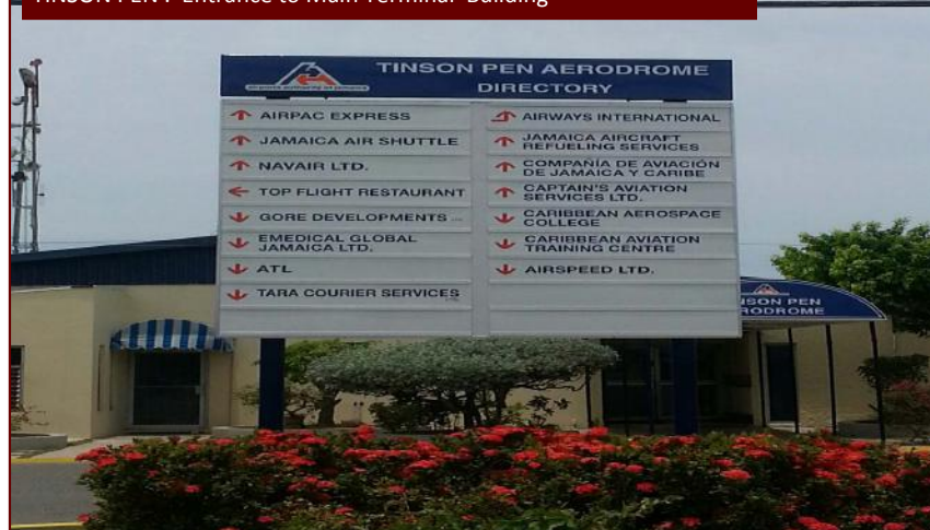
TINSON PEN : Entrance to Main Terminal Building

Tinson Pen has always maintained its position at the forefront of General Aviation in Jamaica due to it's being the largest of all the aerodromes in the island and the starting point for such local aviation pioneers as the Flying Club, a group of wealthy aviation enthusiasts who went on to assist in search and rescue missions prior to the inception of the Jamaica Defense Force Air Wing; and Wings Jamaica Ltd, the first flight school in the island. Additionally, the Tinson Pen Aerodrome has provided the ideal location for the development of domestic air travel with many companies over the years having a