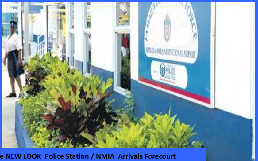
The NEW LOOK Police Station / NMIA Arrivals Forecourt