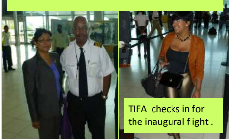
TIFA checks in for the inaugural flight .