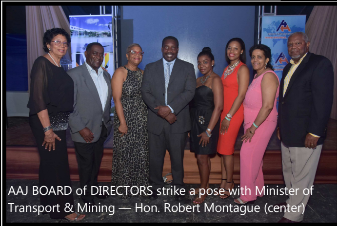
AAJ BOARD of DIRECTORS strike a pose with Minister of Transport & Mining — Hon. Robert Montague (center)