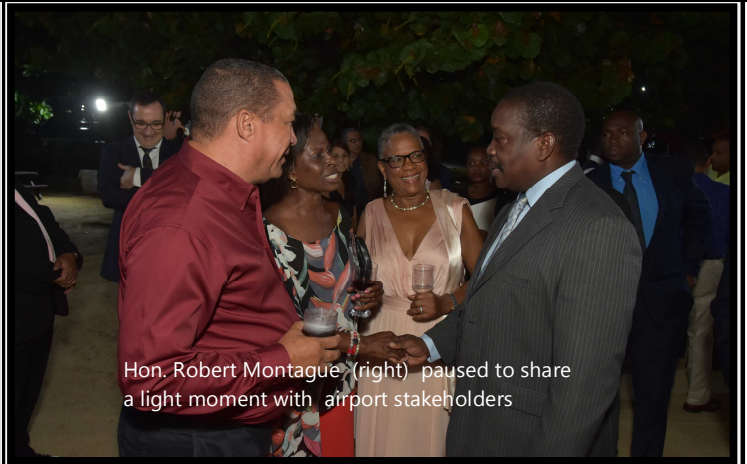
Hon. Robert Montague (right) paused to share a light moment with airport stakeholders