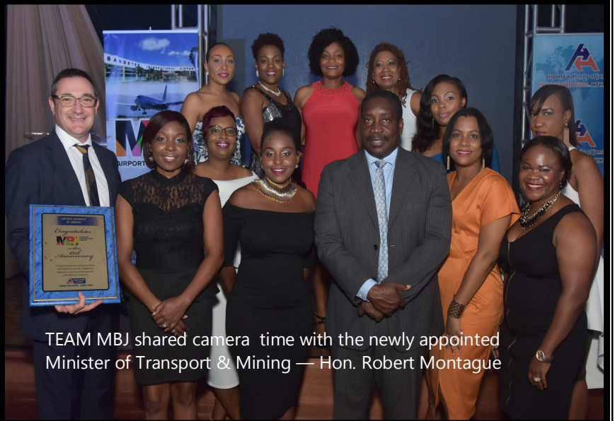
TEAM MJB shared camera time with the newly appointed Minister of Transport & Mining — Hon. Robert Montague

VENUE HILTON Rose Hall Resort, Montego Bay