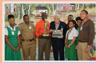
MIDDLESEX | MANCHESTER HIGH SCHOOL | Manchester Presenter: (c) Hon. Lester 'Mike' Henry, CD, MP, Minister of Transport & Mining