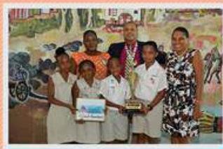
SURREY | THE QUEEN'S PREPARATORY | Kingston