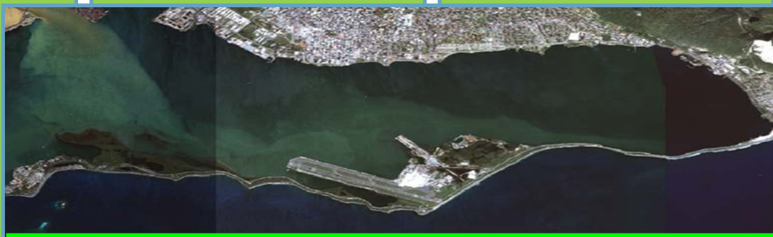
Aerial view of the Palisadoes-Port Royal Protected Area showing runway of the Norman Manley Intl.

ARTICLE SUBMITTED by National Environment and Planning Agency