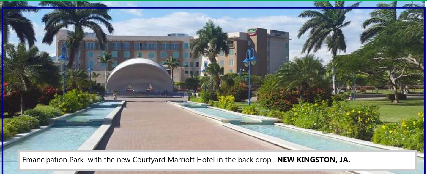
Emancipation Park with the new Courtyard Marriott Hotel in the back drop. NEW KINGSTON, JA.

KINGSTON, Jamaica — New York Times has designated Kingston as one of the top 52 Best Places to Go in 2017,