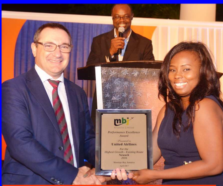
UNITED AIRLINES Highest Growth—Existing Route (NEWARK)