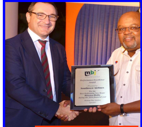
SOUTHWEST AIRLINES Best Performing New Route