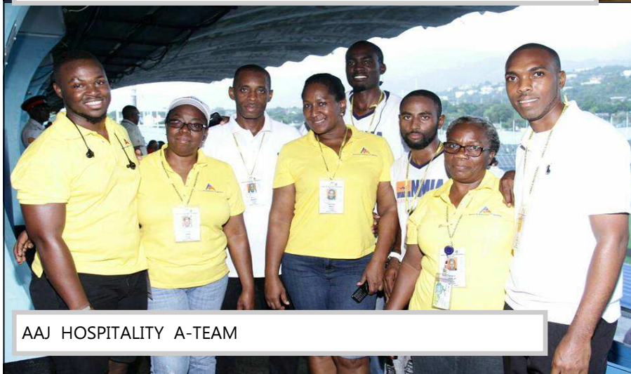
AAJ HOSPITALITY A-TEAM