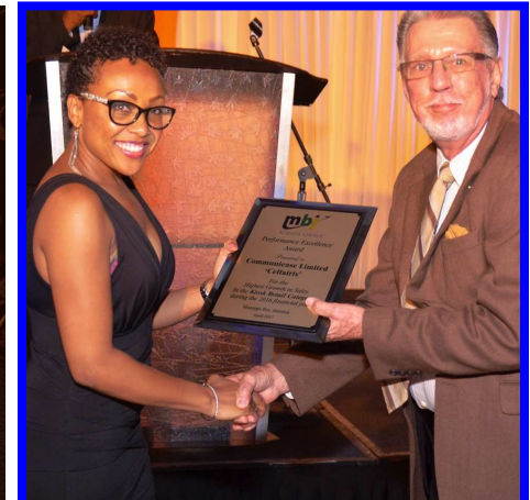
COMMUNICASE LIMITED | 'CELLAIRIS' Highest Growth in Sales KIOSK RETAIL CATEGORY