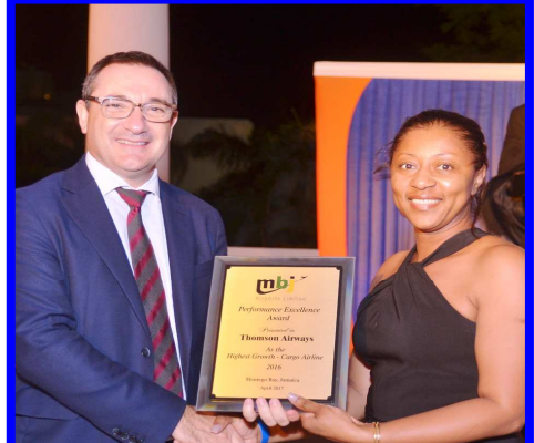
THOMSON AIRWAYS Highest Growth—CARGO AIRLINE