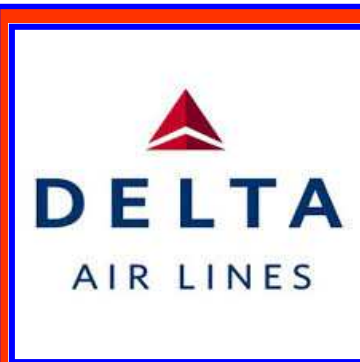
DELTA AIR LINES Highest Growth - Passenger Airline