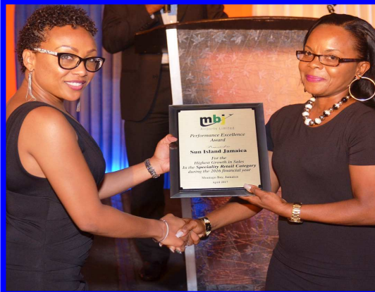
SUN ISLAND JAMAICA Highest Growth in Sales — SPECIALTY RETAIL CATEGORY