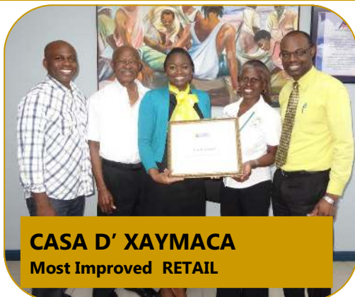
CASA D' XAYMACA Most Improved RETAIL