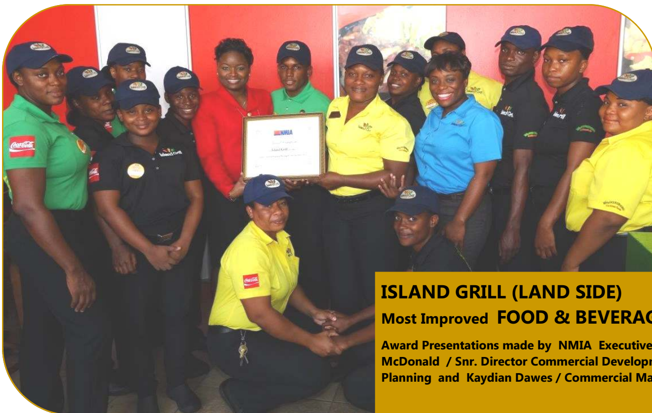
ISLAND GRILL (LAND SIDE) Most Improved FOOD & BEVERAGE