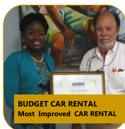
BUDGET CAR RENTAL Most Improved CAR RENTAL