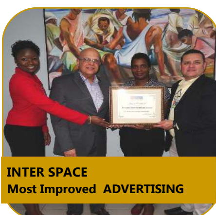
INTER SPACE Most Improved ADVERTISING