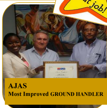
AJAS Most Improved GROUND HANDLER