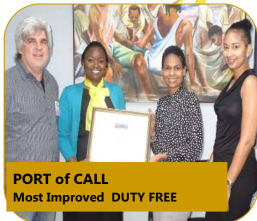
PORT of CALL Most Improved DUTY FREE