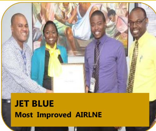
JET BLUE Most Improved AIRLINE