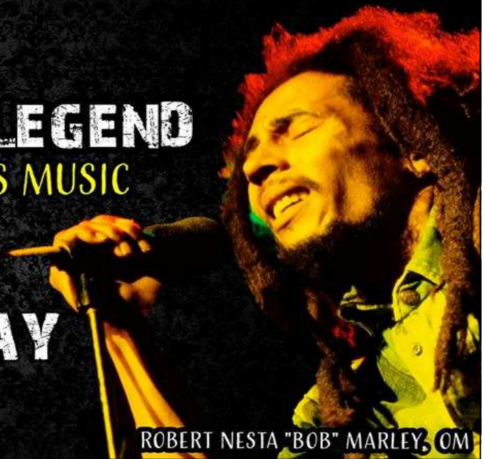
ROBERT NESTA "BOB" MARLEY, OM