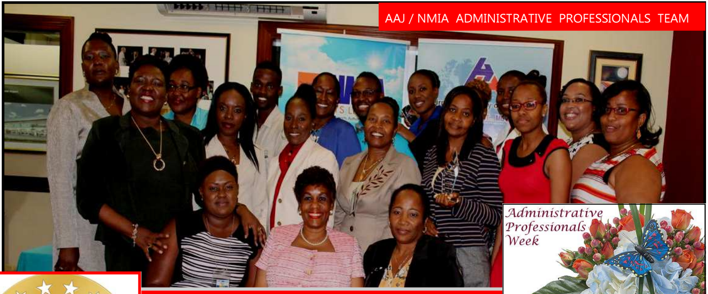
Administrative Professionals Week